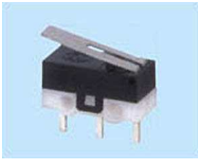
MSM-22 1 A 125/250 VAC SPDT 3P