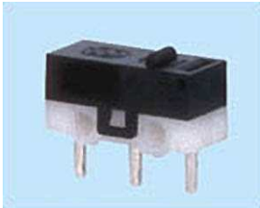
MSM-21 1 A 125/250 VAC SPDT 3P